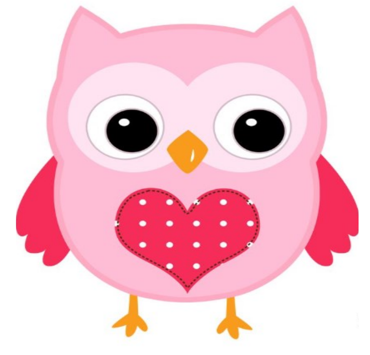
Older Wiser LutheranS

OWLS will gather on Friday, February 28th at 1pm